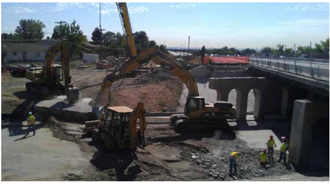
Ames/Granite demolition crew at US 36 bridge over Lowell Boulevard